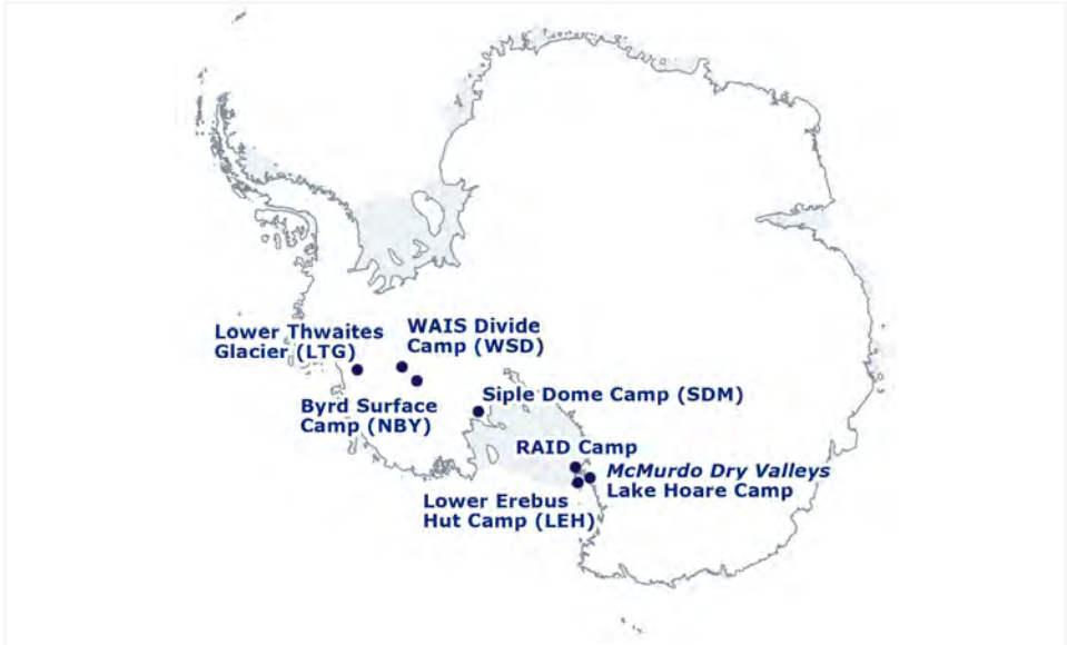
Figure 1. Map of 2019-20 USAP field-camp locations

In 2019-20, seven field camps will have resident staff providing logistics and operations support to McMurdo-based researchers. In addition to the map of each camp location, descriptions of camp activities are also included.